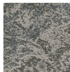
Heritage 85530 LRV 15.4