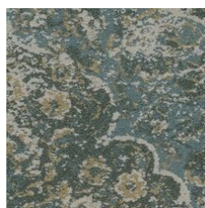
Novelty 85327 LRV 21.2